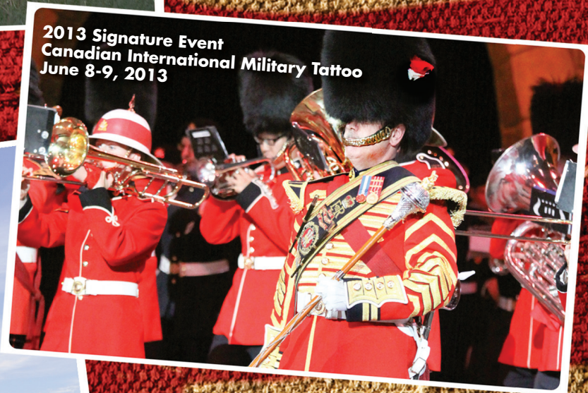
2013 Signature Event Canadian International Military Tattoo June 8-9, 2013