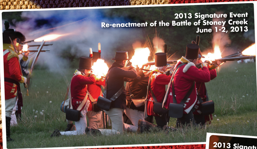
2013 Signature Event Re-enactment of the Battle of Stoney Creek June 1-2, 2013

HAMILTON 2012-2014 1812-1814 BICENTENNIAL