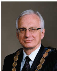
Robert Bratina Mayor