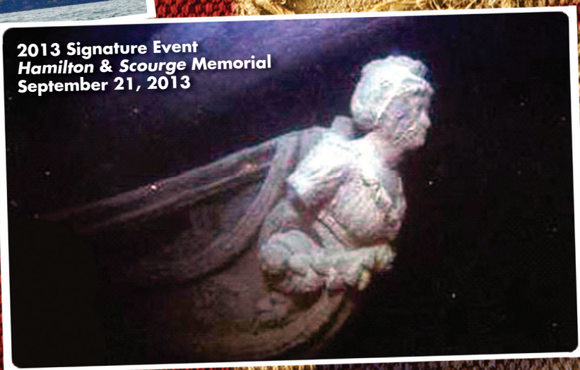
2013 Signature Event Hamilton & Scourge Memorial September 21, 2013

Your Guide to Events, Attractions, History, and more!